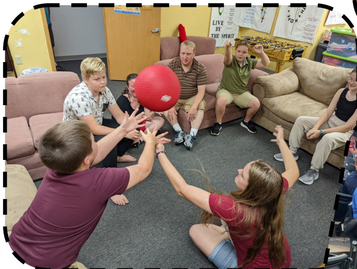
Youth playing a game after the kick-off event.