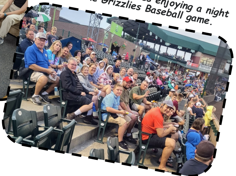
Youth group families enjoying a night at the Grizzlies Baseball game.