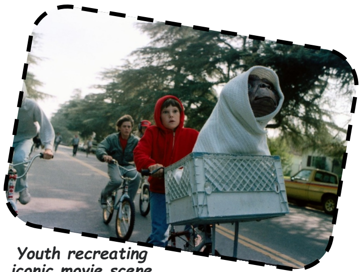
Youth recreating iconic movie scene from ET.