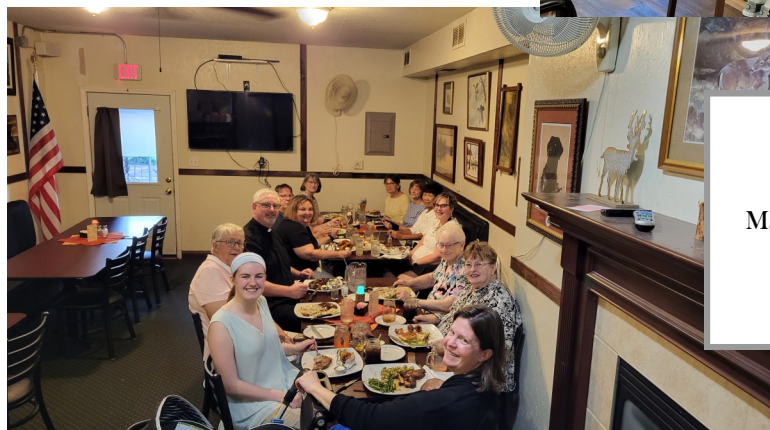
Zion's Ladies Aid enjoying dinner at Mascoutah Steakhouse after singing on August 17.