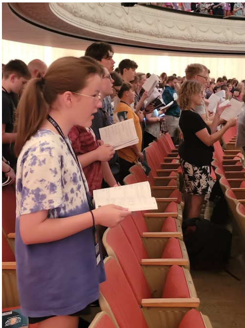
At daily worship services at the Higher Things Youth Conference.

Thank you to everyone who has supported us through our fundraisers. We really appreciate all of your support. Thank you especially for your support with our mum fundraiser. Our youth group attended the Higher Things Youth Conference at SIU Carbondale. Attending this conference was an amazing time of fun and fellowship with other Lutheran youth as well as enrichment through worship and breakouts.