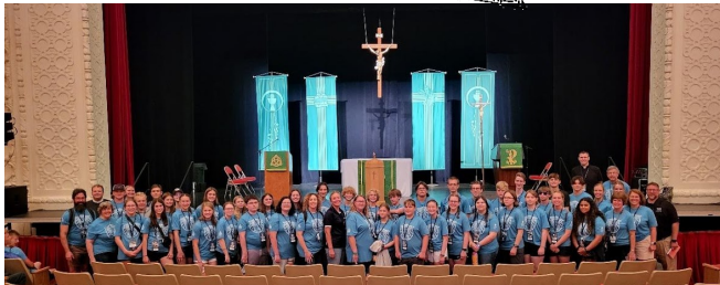
Southern Illinois District attendees at the Higher Things Youth Conference in Carbondale.

Thank you to everyone who has supported us through our fundraisers. We really appreciate all of your support. Thank you especially for your support with our mum fundraiser. Our youth group attended the Higher Things Youth Conference at SIU Carbondale. Attending this conference was an amazing time of fun and fellowship with other Lutheran youth as well as enrichment through worship and breakouts.