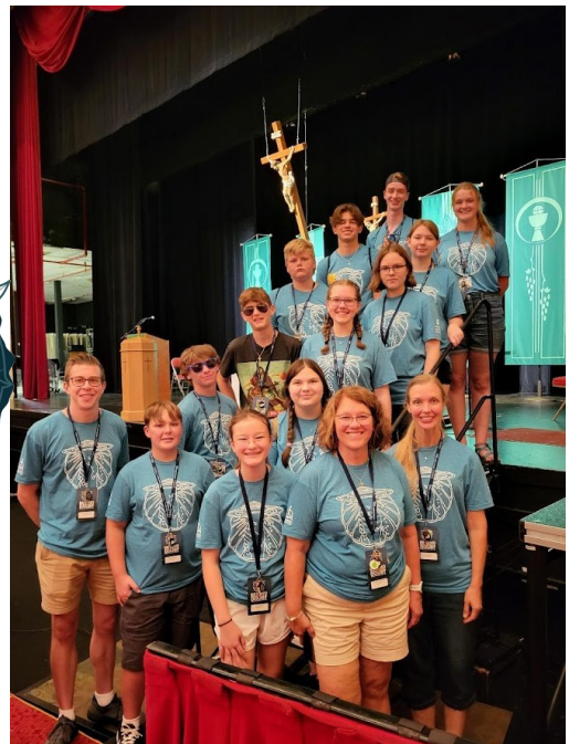
Zion youth and adults at the Higher Things Youth Conference at Carbondale from July 18-21.