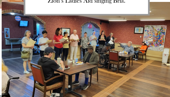
Zion's Ladies Aid singing Bria.

On Thursday, August 17, 2023, members of Zion's Ladies Aid sang at Bria, Brightly, and MarKa, and then enjoyed a very pleasant supper together at the Mascoutah Steakhouse.