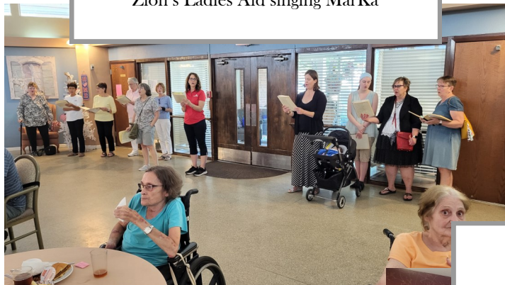
Zion's Ladies Aid singing MarKa